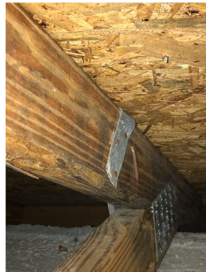
Back side of straps