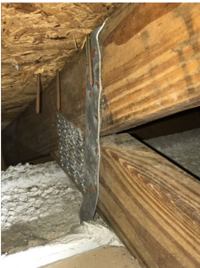
Front side of straps