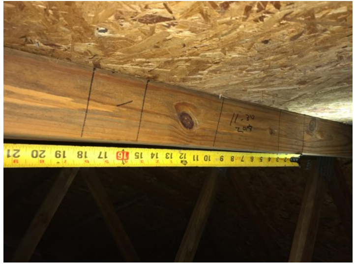
8d nails spaced no more than 6"